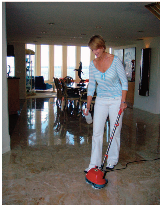
Just spray any household surface cleaner and let the micro-fiber pads do all the work.