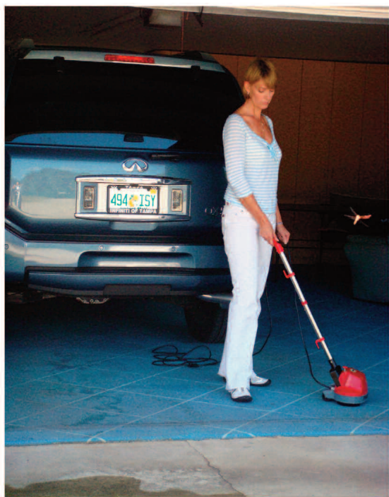
Powerful enough to scrub clean garage floors.