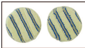
Microfiber pads for hard floor cleaning and polishing. B100326