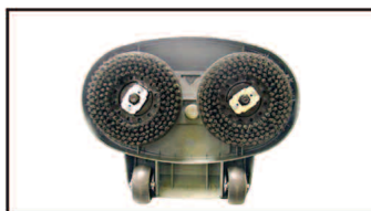
Scrub brushes for deep cleaning of hard floors and carpet stains. B100329