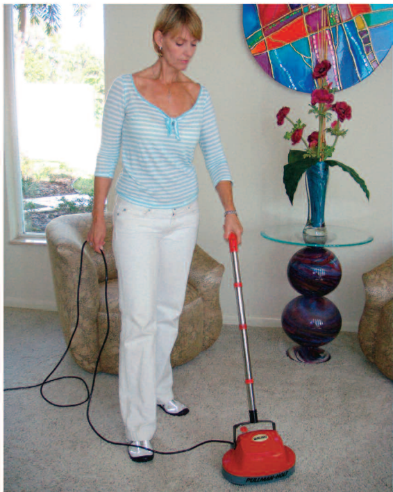
Excellent for removing spots and stains from carpets.